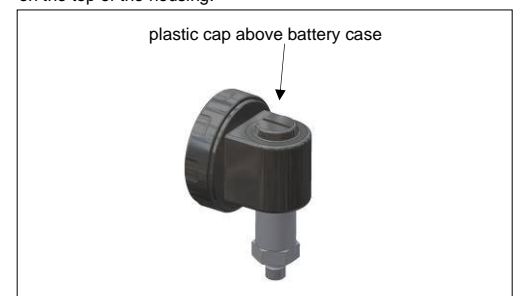
Fig. 3 Battery case

The battery case is located under the black, circular plastic cap on the top of the housing.