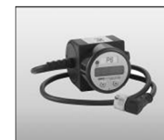
Fig. 4 Programming device P6