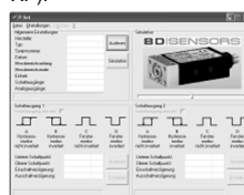
Fig. 2 programming software

The programming adapter is part of the programming kits CIS 685 and CIS 686 which contains i.e. a CD-ROM with the configuration software P-Set. All cables required for connecting the pressure switch have to be plugged to the programming adapter (included in scope of delivery). The user only requires a Windows® PC with serial interface (CIS 685) or USB-interface (CIS 686). Installing the configuration software P-Set is very easy. P-Set runs on all Windows® PC's (95, 98, ME, 2000, NT, XP).