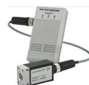
Fig. 3 programming adapter