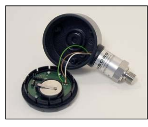
Abb. 4 battery case